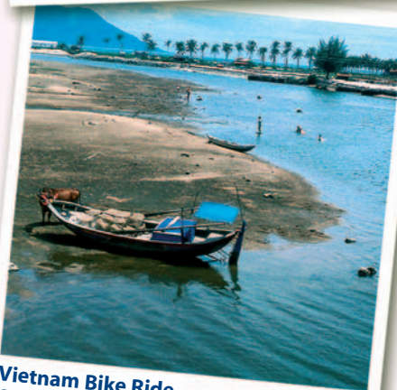
Vietnam Bike Ride October - November 2007

• No commitment • Hassle free overseas events • FREE personalised brochures