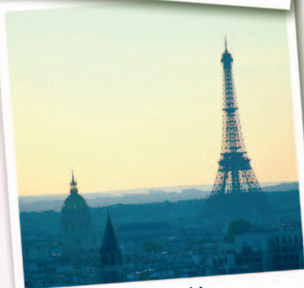
London to Paris cycle ride June 2007

Administration Support: Keeping you informed at all times we will take care of the entire administrative procedure from receiving registration forms and banking sponsorship money, to processing visa applications and ensuring each participant has insurance.