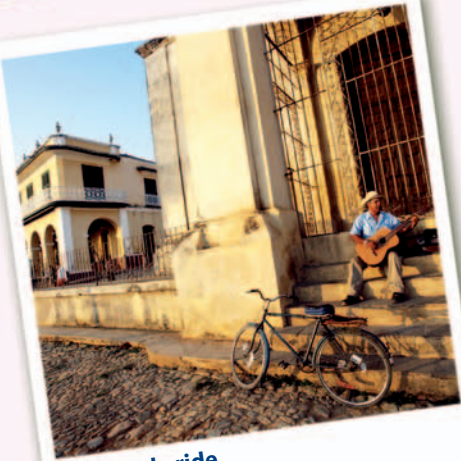
Cuba cycle ride February 2007

Due to the ongoing success of our Open Overseas events, we are pleased to announce the forthcoming release of our brand new 2007 Open Overseas Challenges which we are now able to offer on a no commitment basis. These events give all UK charities the opportunity of benefiting from the excellent fundraising potential of overseas events without incurring the high costs and risks normally associated with this fundraising method!