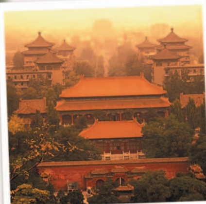
China Trek May 2007